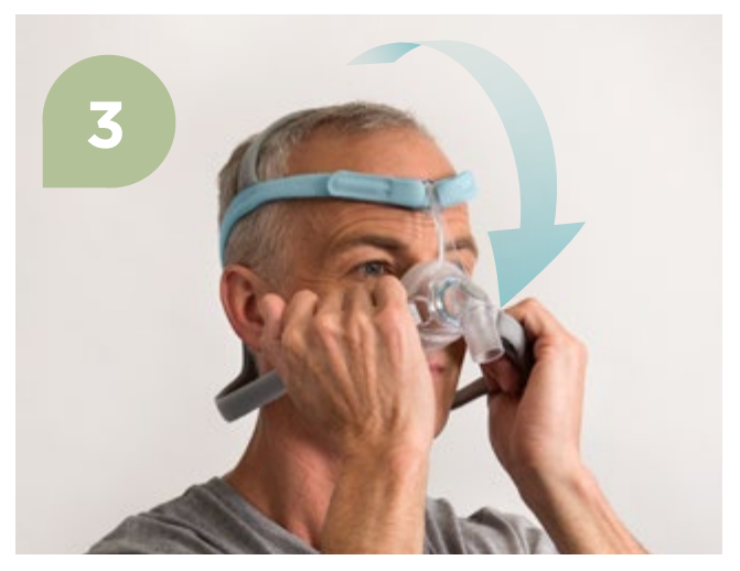
Place your hands on the bottom straps on either side of the mask frame and pull out and downwards. Ensure the silicone seal rests over your nose and the blue top strap is sitting on your forehead.