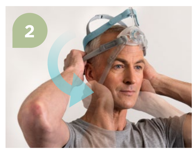
Guide the headgear over your head so that the silicone seal is resting on your forehead.