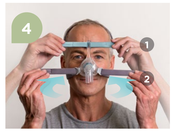
Gently tighten the headgear straps of the mask headgear starting with the blue forehead straps followed by the bottom straps.